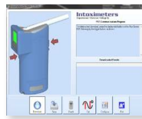
"FST View PC Interface"